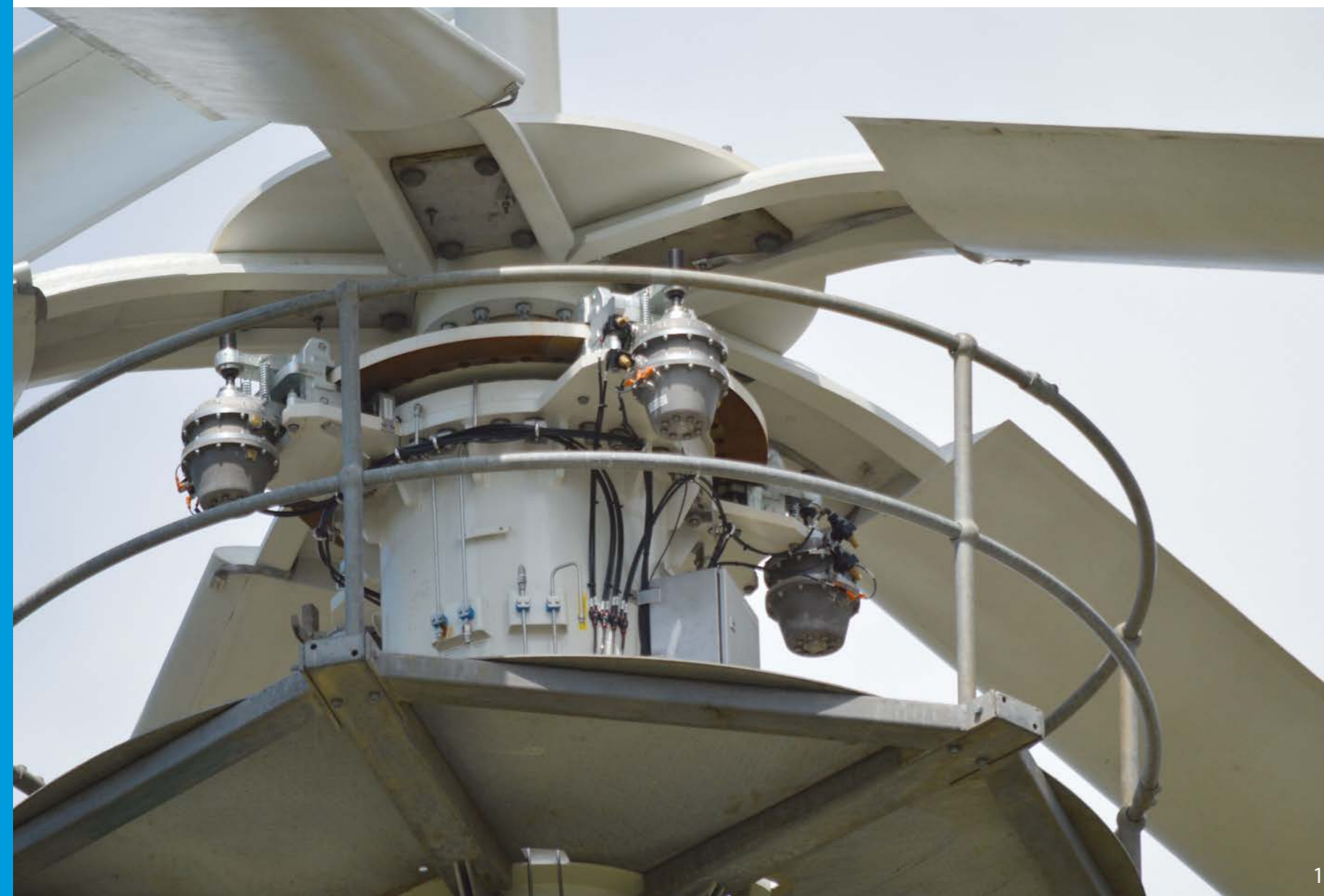
Figure 3: Brake of the series EV028 on a gearbox.