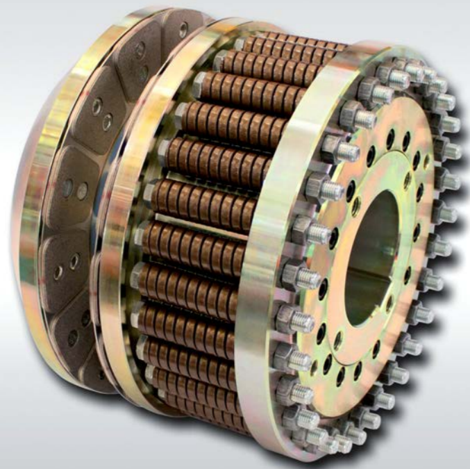
RINGSPANN has developed its new high-performance friction torque limiter type RSHD as customised overload protection for heavy-duty applications, as are typical in the work of wind power plants.